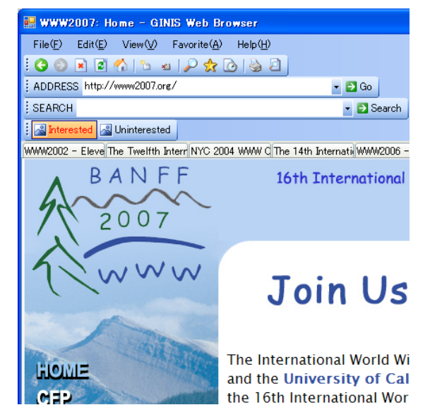
Figure 2. GINIS Browser User Interface

The GINIS Framework consists of 4 main modules: a client interface to detect and log user behavior (the browser), a database to store the user log information (the Logger), a learning engine (the Learner) and a prediction engine(the Predictor).